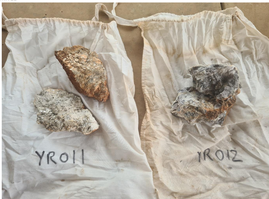
Figure 3. Muscovite, Zinnwaldite and contrasting Grey Lepidolite up to 15% by volume in Pegmatite Samples

Rock chips contained varying amounts of lithium mica; primarily lepidolite and possible zinnwaldite (Figure 3). The absence of spodumene in the dykes has been confirmed by assay and downgrades these targets.