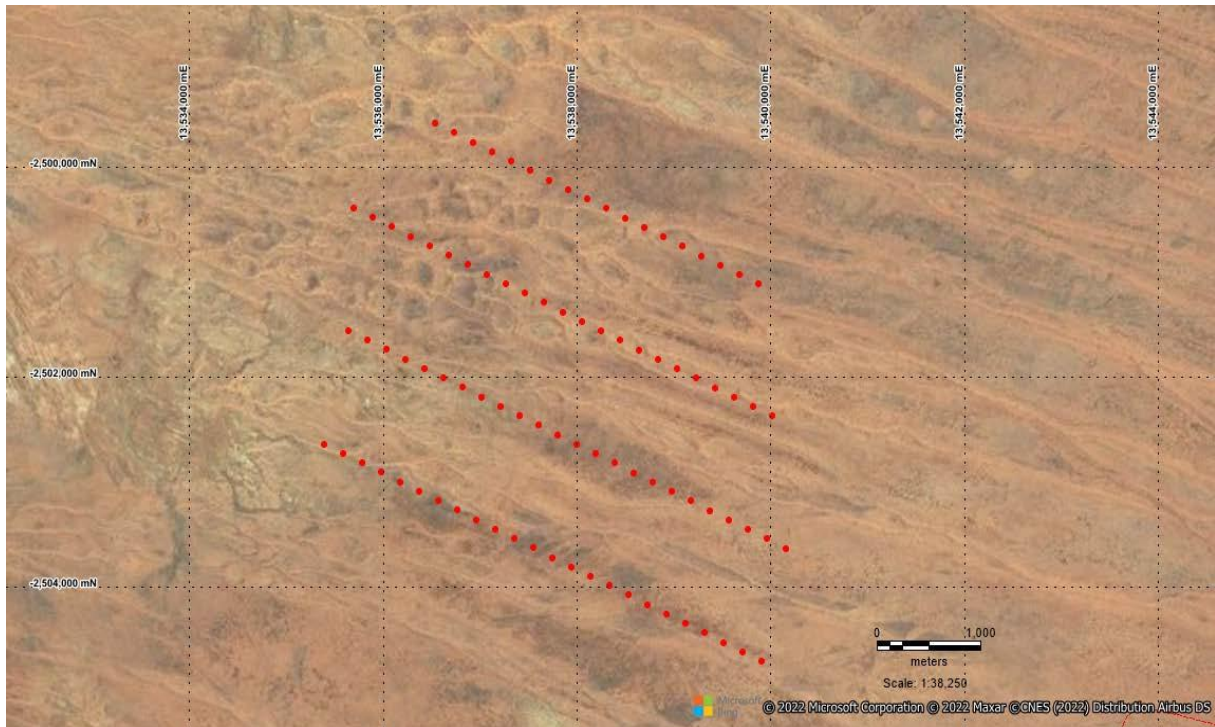
Figure 5. MLTEM RX loop planning Background image.