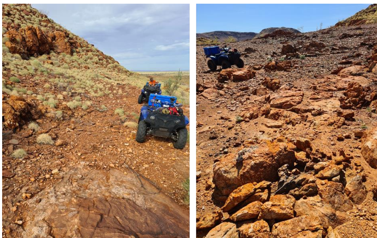
Figure 2. Thick south dipping pegmatite bodies located within the tenement package.

Adjacent tenure to the east has been drilled into by the Wodgina tenement holders and targets the tantalite and lepidolite bearing dyke swarms that trend into the Yule River Project. The highest anomalism for areas sampled was the area previously identified by Metalicity at Stannum.